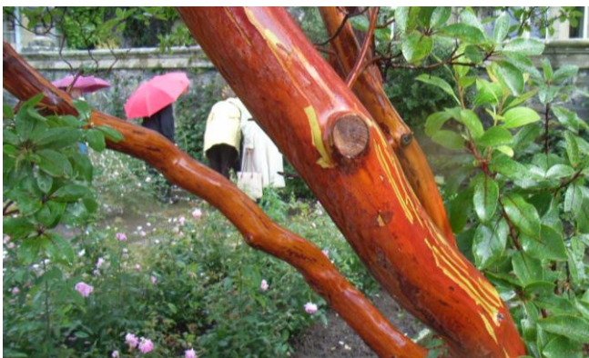
The rain failed to dampen spirits on the visit to Bodnant and had the bonus of lifting the colour of bark to glorious effect