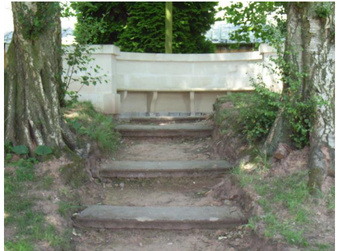
Above left, we study Tom Stuart-Smith's planting plan. Above right, part of the Trentham Chelsea Garden. The team is planning how to create the right setting for the seat.

In addition to the Italian Garden, there are walks through the woodland and around the lake. Trentham Active includes the Aerial Extreme where the adventurous can swing, climb and slide their way from tree to tree up to 40ft above the forest floor. For more information go to www.trenthamleisure.co.uk .