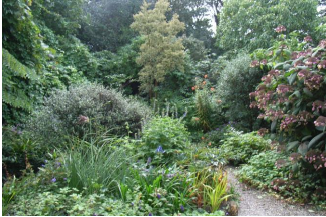
A view of Sue and Bleddyn's garden – showing their ability to display the plants they collect to great advantage

Cheshire Gardens Trust was well represented at the AGM and Conference in Bangor, 1-3 Sept. with 3 members there for the duration, and one for Saturday. The AGM itself took place on the Friday, getting the 'work' out of the way. Then, following the evening meal, we were entertained by a talk from Bleddyn & Sue Lloyd-Jones of Crug Farm Nurseries and their adventures as modern-day plant hunters.